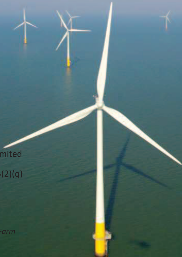
Photo: Kentish Flats Offshore Wind Farm

Date: June 2018 Revision: Version 1 Author: BECG