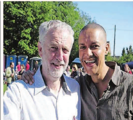
Jeremy Corbyn and Clive Lewis at the Bursdon School Strike Rally in 2015.

It will be the Labour leader's first visit to the region since May,